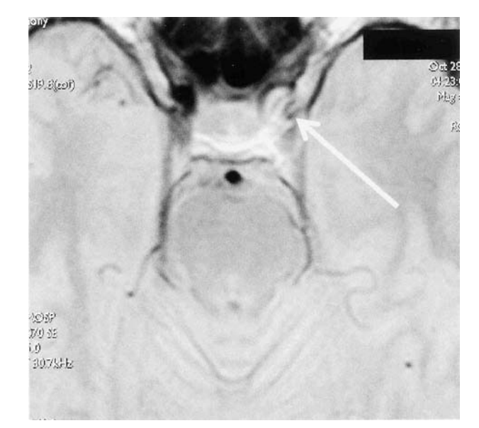
Figure 2 MRI of left internal carotid artery with the site of dissection at the base of skull.

He had normal blood parameters including lipids. Aspirin and clopidogrel were started after confirming multiple low attenuation areas in the left frontoparietal cortex on a computed tomogram. A duplex scan of carotid arteries showed normal extracranial arteries but there was high resistance waveform, consistent with distal obstruction suggesting subintimal dissection (fig1). This was confirmed by magnetic resonance angiogram (figs 2 and 3). Therefore heparin infusion was started.