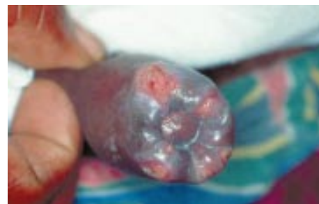
Figure 1 Penile ulceration due to chancroid.

It has been reported that the proportion of genital ulcers attributable to herpes simplex virus (HSV) in sub-Saharan Africa is increasing and