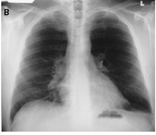
Figure 3 (A) Acute lupus pneumonitis in a 45 year old man. He was treated with corticosteroids and a follow up chest radiograph (B) at four weeks revealed considerable improvement.