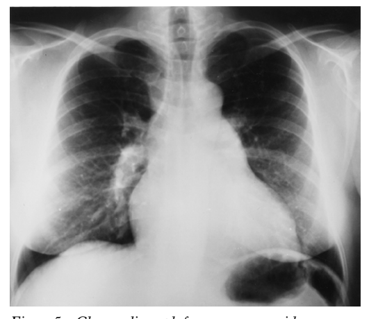
Figure 5 Chest radiograph from a woman with severe pulmonary hypertension (pulmonary artery pressure 120/60). Note the prominent pulmonary arteries bilaterally with straightening of the left heart border and attenuation of the peripheral vessels. Reproduced with permission from Orens et al.<sup>3</sup>

Descriptions of primary pulmonary vascular disease in the absence of parenchymal disease are uncommon. Forty nine cases were reported between 1952 and 1986.<sup>34</sup> Demographic features of pulmonary hypertension complicating SLE are similar to those observed in primary pulmonary hypertension (fig 5).<sup>3</sup> Raynaud's phenomenon is present in 75% of cases. The pathogenesis of pulmonary hypertension remains obscure, but multiple factors may be operative including pulmonary vasculitis, thrombosis, and pulmonary artery vasocon-