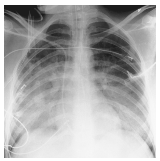
Figure 4 Acute alveolar haemorrhage. Chest radiograph showing extensive bilateral alveolar infiltrates in a 22 year old woman with SLE, haemoptysis, and anaemia. Reproduced with permission from Keane et al.<sup>30</sup>

course may be fulminant and occasionally fatal. Immunosuppressive or cytotoxic agents are reserved for corticosteroid-recalcitrant patients.