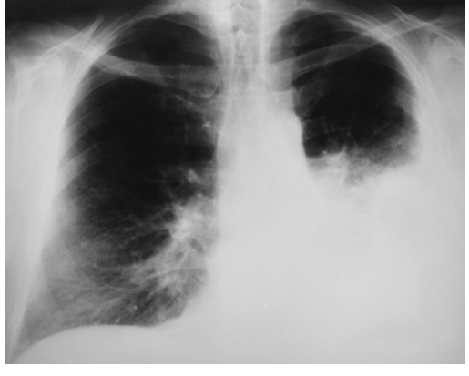
Figure 1 Chest radiograph showing left pleural effusion in a 50 year old man with arthritis, fever, and high titre anti-DNA. Thoracentesis demonstrated typical LE cells.

Clinically significant chronic interstitial pneumonitis (CIP) complicates SLE in 3-13% of patients but is rarely severe. 1 3-6 Asymptomatic involvement is more common and abnormalities in pulmonary function tests have been cited in up to two thirds of patients with SLE in some studies.3 20 Progression of recurrent acute lupus pneumonitis to CIP probably occurs since there are examples of persistent disease following acute onset, and the mean age of onset of acute disease (38 years) is earlier than that for chronic disease (46 years).2 Chest radiographic abnormalities consistent with CIP have been cited in 6-24% of unselected patients with SLE.20 21 A recent prospective study assessed chest radiographs,