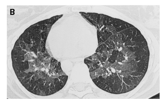
Figure 6 (A) Inspiratory HRCT scan of a 43 year old woman with SLE and obliterative bronchiolitis. Faint areas of ground glass opacity are apparent. (B) Expiratory HRCT scan in the same subject with accentuation of the mosaic pattern of ground glass opacity. Reproduced with permission from Lynch et al.<sup>99</sup>