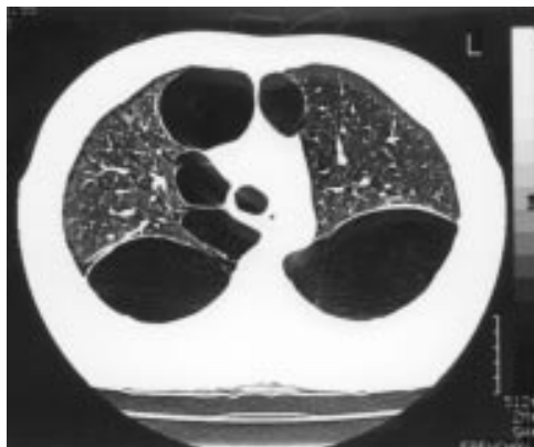
Figure 2 High resolution CT scan of the thorax showing multiple large peripheral bullae in the upper lobes of a 46 year old man.

This 35 year old West Indian man was the brother of case 3. He originally presented at the age of 20 with malaise and abdominal distention. On examination he was found to be pyrexial with a right sided pleural effusion, underlying consolidation, and ascites. Despite investigation, no infective cause was found and he was treated empirically with antituberculous treatment. His compliance with medication