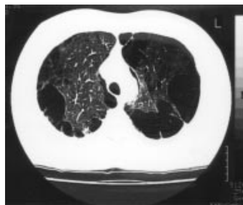
Figure 1 High resolution CT scan of the thorax showing bilateral apical peripheral bullae in a 27 year old man.

Keywords: lung bullae; marijuana; smoking; emphysema