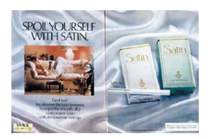
Figure 1 In this 1983 Satin "Couch" advertisement, the caption reads, "Go ahead. You deserve this Satin moment. So enjoy the smooth, silky taste of new Satin with the luxurious Satin tip". With the Satin brand and advertising campaigns, Lorillard attempted to capture a sensuous image of highly feminine—not feminist—women. This campaign was designed to communicate a self indulgent, relaxing, escapist fantasy for mature, busy women, whether employed or not, who felt pressured by many demands on their time.

The 1982 Satin marketing strategy was "to convince the target that only Satin can pamper and gratify her special feminine needs and moods when it comes to smoking