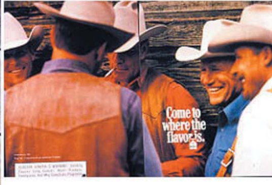
Figure 4 The left image of the stern and solitary cowboy is a Marlboro advertisement from 1960; the right image, updated to show friendly cowboys socialising, is from 1999. As the values of young people in the USA shifted away from rugged individualism and toward a sense of community, PM attempted to update the Marlboro Man image to maintain relevance with the younger market. The Marlboro Man in the 1990s began to smile, socialise, enjoy leisure time, and show his softer, more accessible side.