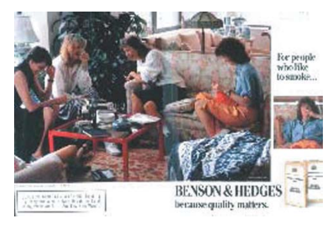
Figure 2 With the 1986 Benson & Hedges "For People Who Like to Smoke" campaign "Living Room Girls" execution, PM attempted to combat the declining social acceptability of smoking through brand image. "For People Who Like to Smoke" depicted casual, jovial scenes of upper middle class people enjoying meaningful time with friends and family, where conflict between smokers and non-smokers was entirely absent.

The tagline "For people who like to smoke" implied to the respondents a sense of sharing: "we're allies as smokers", "it