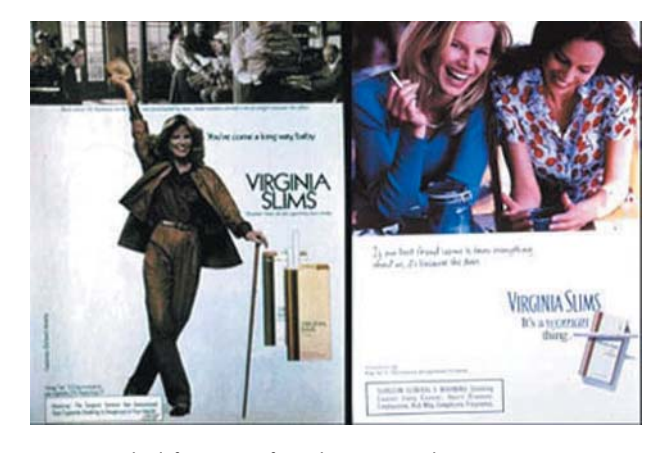
Figure 5 The left image is from the Virginia Slims "You've Come a Long Way, Baby" campaign in 1978; the right is from the "It's a Woman Thing" campaign in 1997. Virginia Slims' core user group was aging, and by the mid 1990s the feminist appeal of the long running "You've Come a Long Way, Baby" campaign was not well received by many younger women. PM recreated the Virginia Slims image by downplaying feminism and emphasising gender stereotyped female relationships. The caption of the right image reads, "If our best friend seems to know everything about us it's because she does. Virginia Slims. It's a woman thing".

Stereotypical gender differences and a return to the traditional war of the sexes may act as a means of carving out the exclusive in-group to which women belong. Respondents in Marketing Perceptions' research said, "Women build really close friendships. Men don't seem to ever be as close... Guys go out to lunch to eat. Women go to chat". Similar statements are featured in Leo Burnett's