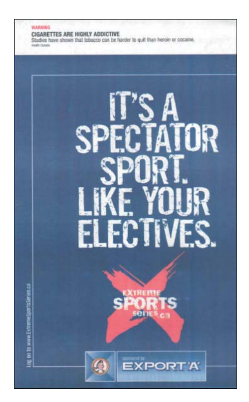
Figure 1 Campus newspaper advertising.

All analyses were conducted using SPSS (version 12.0). Given the organisational differences between colleges and universities described above, the results for these institutions are reported separately.