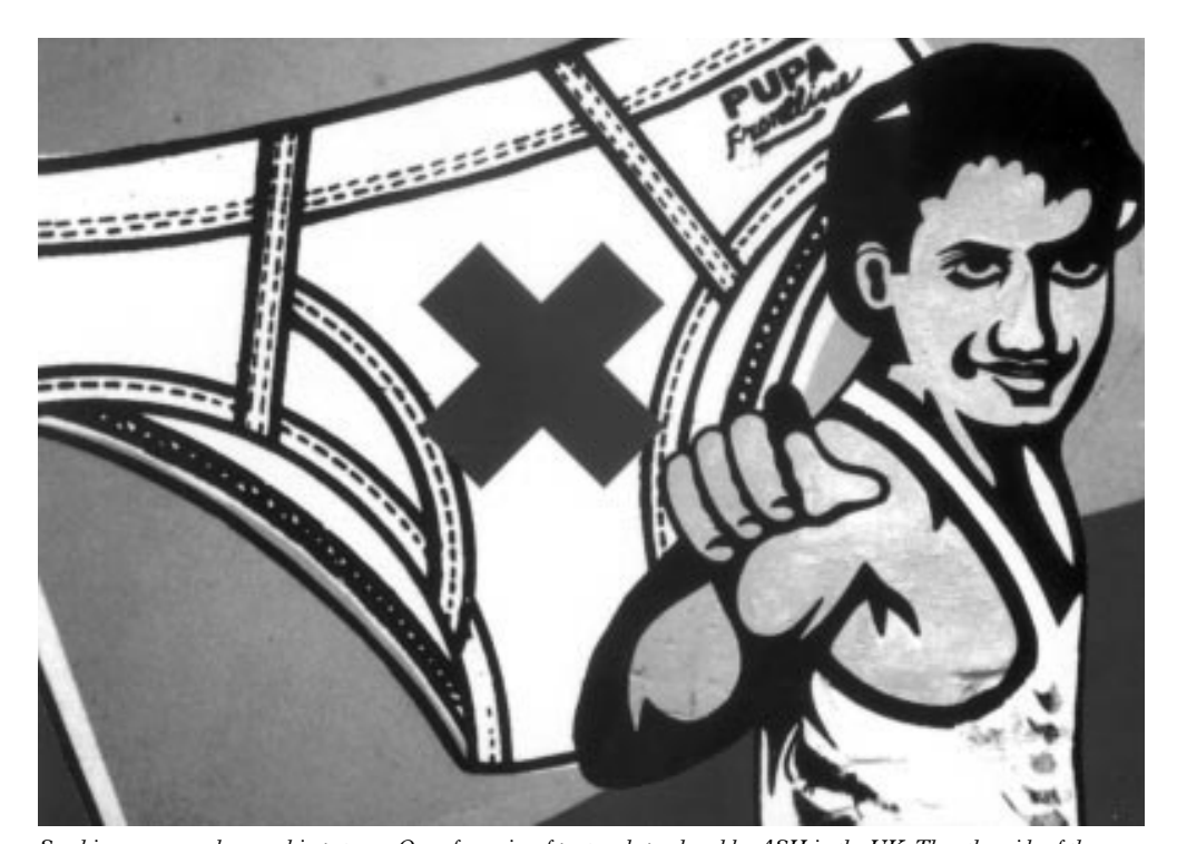
Smoking causes male sexual impotence. One of a series of postcards produced by ASH in the UK. The other side of the postcard states that 120,000 UK men in their 30s and 40s are currently impotent due to smoking and reports that a MORI poll conducted in April 1999 found that 88% of smokers failed to identify the link between impotence and smoking.