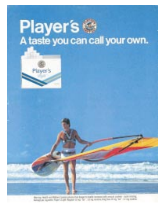
Figure 1 Exhibit 1: Player's contemporary lifestyle (solo wind surfer).

and be "close to nature" with "nobody to interfere, no boss/parents", and self reliant enough to experience solitude without loneliness.<sup>32</sup>