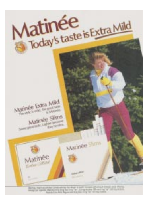
Figure 6 Exhibit 6: Matinee "Picture of Health" (cross country skier)

The "Vantage family copy strategy and platform" stated the brand's psychological "benefit" in terms of being seen as intelligent (fig 5). "Vantage smokers will be perceived as being intelligent urban adults who enjoy or aspire to a progressive cosmopolitan lifestyle. Moreover, their cigarette brand will be viewed as the only contemporary choice for intelligent smokers. As intelligent individuals, they will be seen as self confident, career oriented socially active and cosmopolitan in their outlook on life". 71