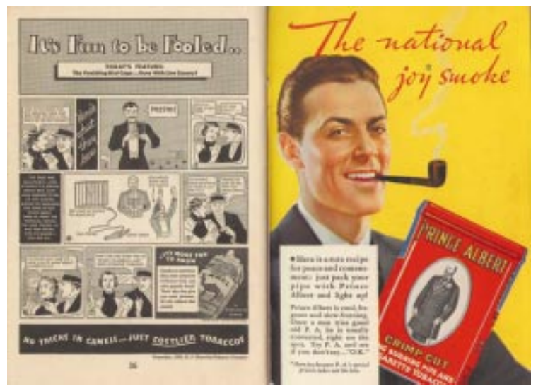
And here are some other tricks we didn't find in the book. Light up, and watch people leave the room. Works every time! Ask a tobacco executive to tell you what "cause" means... wait an hour, and now try and untie the verbal knot he creates. Bet you can't!"