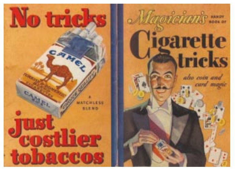
Yes, indeed. It's fun to be fooled by Camel... by not being told about carcinogens, that there's a small problem about lung cancer after years of use, and quite a few more things besides.