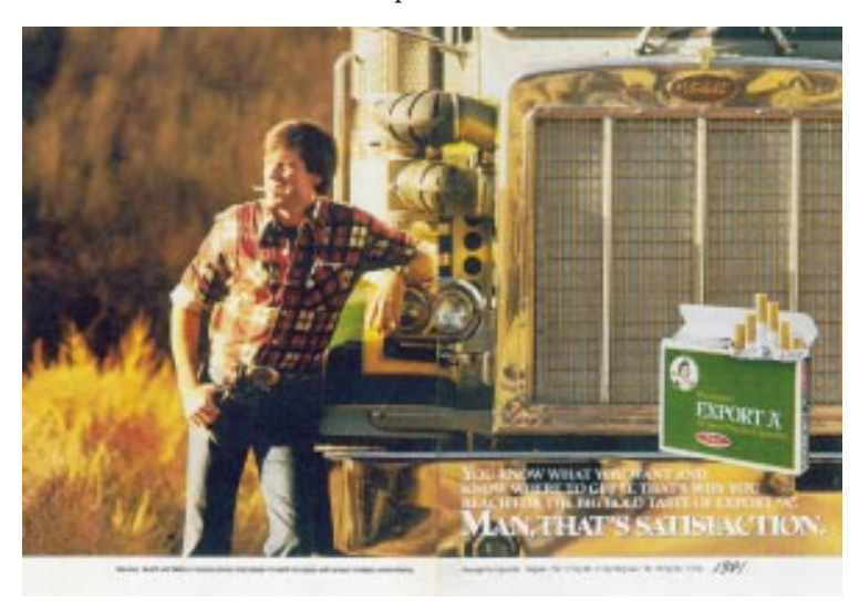
Figure 2 Exhibit 2: Export A rough blue collar imagery (trucker).

The thinking behind the 1980s advertising for Player's is interesting for the corporate sensitivities to the subtleties in crafting ad imagery. One document outlines advertising where the scenes are outdoors, with activities that "should not require undue physical exertion." "They should not be representative of an elitist's sport . . . one which is practised by young people 16 to 20 years old . . . The activity should not be limited to a certain social class or inaccessible to our target group because of modest means . . . the chosen scene should ideally [sic] depict a pause or moment of relaxation . . . However, the scene may show participants in action if the moment of product consumption can be assumed to be close to the