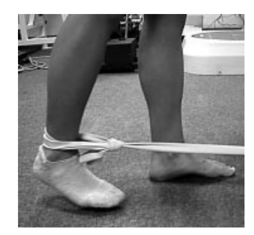
Figure 3 "T-band kicks" training.

Subjects in the B group performed the above exercise protocols in conjunction with one another. As expected this