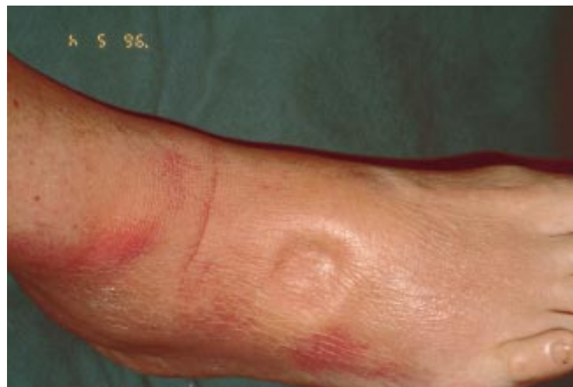
Figure 1 Patient 2. Soft tissue swelling of malleolar and perimalleolar areas with pitting oedema of the dorsum of the right foot. The distribution of the oedema follows the course of peroneal, tibialis, and extensor tendons of the foot.

† SACE= serum angiotensin converting enzyme (normal value: 18-55 U/l).