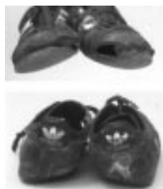
Figure 2 Severely worn sports shoes.