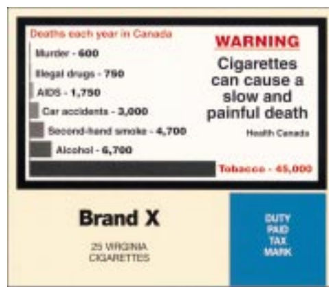
Figure 3 The new warnings, if adopted, would occupy 60% of the exterior major face.

The warning reforms would not be limited to the outside of the package. Most Canadian packages are made up of the exterior shell (see cover) and an interior slide which surrounds and holds the cigarettes and which the smoker