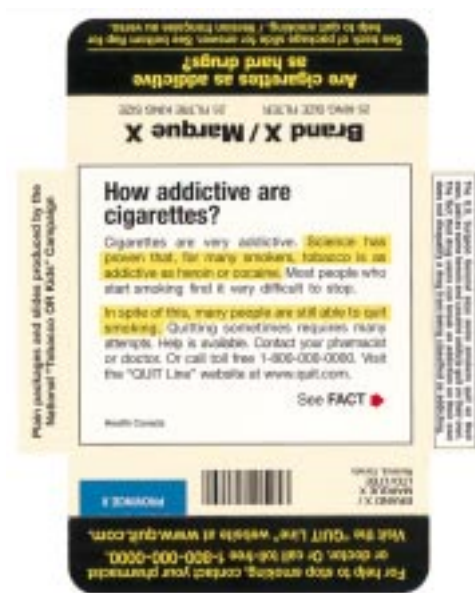
Figure 5 Interior warning of addiction: Tobacco industry documents show that the industry fears addiction warnings above other warnings. One document states “the entire matter of addiction is the most potent weapon a prosecuting attorney can have in a lung cancer/cigarette case. We can’t defend continued smoking as ‘free choice’ if the person was addicted.” (Minnesota Trial exhibit 14303 TIMN 0107 823.)

and young starters who are not yet addicted. They would give the health minister virtually unlimited opportunities to address a variety of subjects such as addiction, nicotine manipulation, and the folly of the use of light cigarettes as an alternative to quitting. These reforms could be introduced at no cost to the taxpayer.