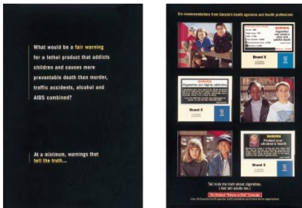
Figure 1 Presentation box for six cigarette packages with the proposed new warning system designed by Canada's National "Tobacco OR Kids" Campaign. Under each package is a picture of children to remind decision takers of the purpose of the new warnings. The box and sample packages triggered significant news coverage.

To implement our strategy, the "Tobacco OR Kids" Campaign held a news conference and delivered the new packages in a dramatic black presentation box (figure 1) to every member of parliament and the senate, and to the national press, editorial boards, and health agencies. The strategy had impact. It triggered unpaid national television, radio, and press coverage that reached millions of Canadians. More importantly, we think the government listened.