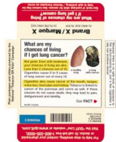
Figure 4 Interior slide that wraps around and holds the cigarettes (see also figures 5–7). The slide warnings create questions and surprises and use all of the surface to make critical points. Quit contemplators and the families of smokers will discover that the packages hold interesting facts all over the package.

moves inside the shell to expose the cigarettes. Health Canada's proposal is to also use at least one side of the interior slide to expand the warning messages. This article shows some of the proposed slide warnings manufactured by the “Tobacco OR Kids” Campaign (figures 4–7).