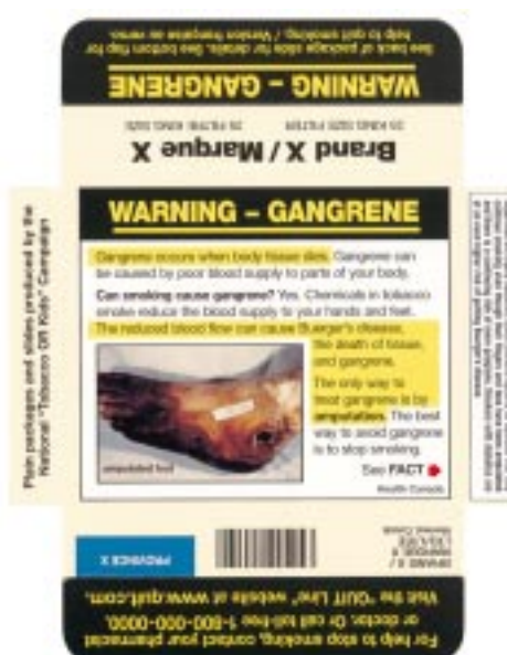
Figure 7 Buerger's disease warning.

available for communication to customers and potential customers. The increased interest these companies are showing in novel pack designs and in novel brands is likely to be a way of exploring how to market cigarettes in a limited advertising environment. The adaption of advertising to the pack itself in this manner is but another reason that a requirement for plain packaging is sound public policy. 14