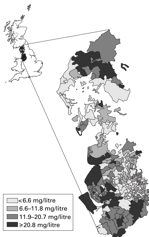
Figure 1 Average drinking (tap) water magnesium concentrations in water supply zones, north west England, 1990-92.

the four variables separately and from the model which included all four variables together.