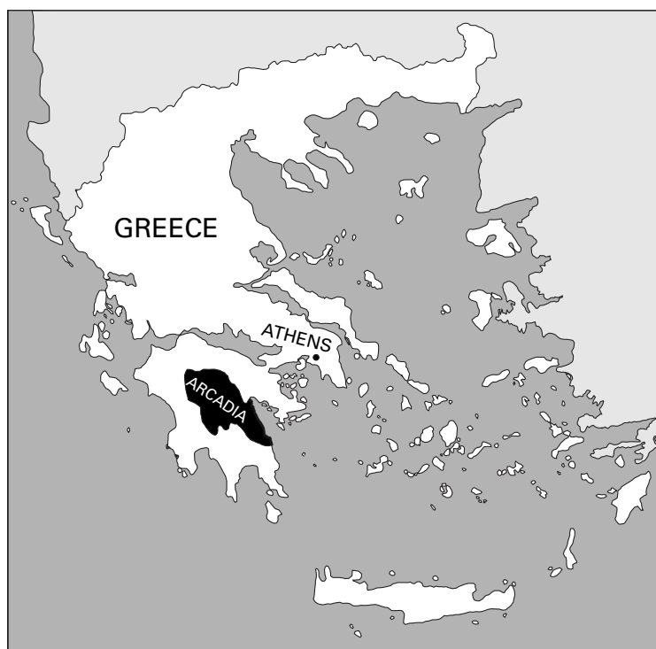
Figure 1 Geographical location of the study area.

monitored often until discharge. On a monthly basis, we visited the health centres to obtain information from the medical records. General practitioners and private family practitioners were also contacted. All the data were collected prospectively. Medical history was obtained and presence of risk factors was evaluated by one of the us (PKT) on the day of admission. For patients not in hospital we used information from notifications of the health centres and attending physicians. Brain CT was made as soon as possible but mostly during the first week after stroke onset. A total of 555 patients with first ever stroke that occurred from 1 November 1993 to 31 October 1995 among residents in the study area was registered. Subjects aged 18 years or below, those with a recurrent stroke, and those with a transient ischaemic attack were not included in the registry. All patients were followed up until death or up to 1 year after their stroke. Outcome data were available for 554 patients at 1 month and for 532 patients at 1 year.