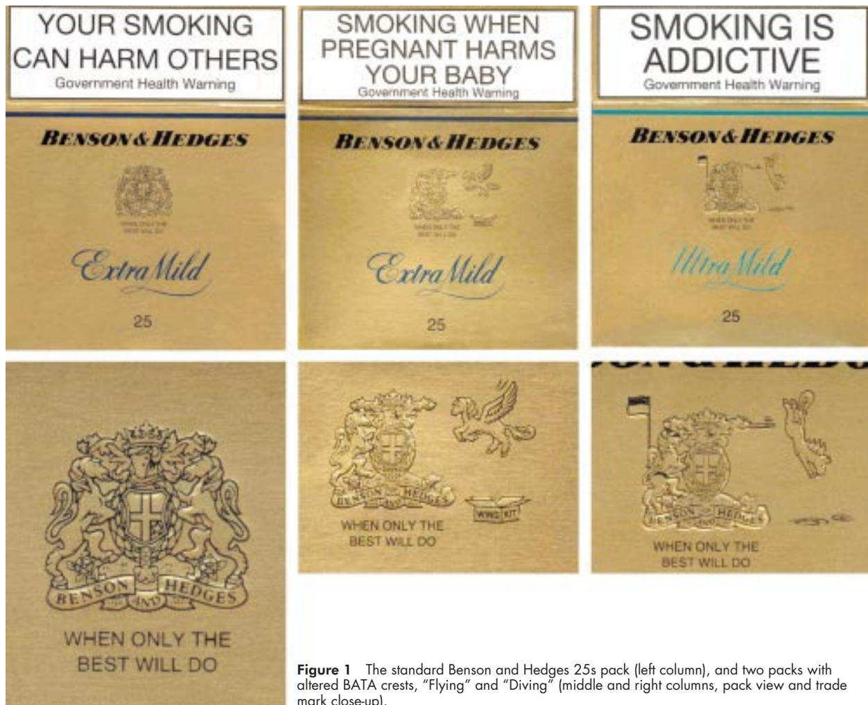
Figure 1 The standard Benson and Hedges 25s pack (left column), and two packs with altered BATA crests, “Flying” and “Diving” (middle and right columns, pack view and trade mark close-up).