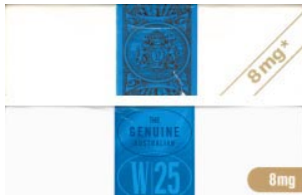
Figure 3 Winfield Super Mild 25’s—regular top of pack (top) and modified top of pack (bottom).