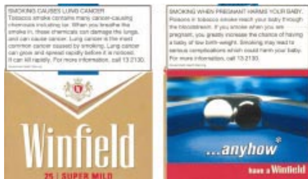
Figure 2 Winfield 25 Super Mild packs—back of a regular pack (left) and back of a pack with advertising image (right).

“Cigarettes, like all other packaged consumer goods, bear trademarks. A trade mark can be a colour, a series of colours, a device, a word, or a combination of any of them. A trade mark is a primary means by which information is imparted to the consumer. It is a means by which one product is distinguished from a multiplicity of competing products (each with its own trade marks) and is a normal marketing tool to retain or expand market share. By performing this function, trade marks become valuable assets protected by law from infringement or imitation.” 13