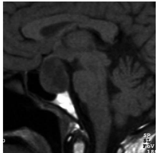
Figure 2 MRI of a typical macroadenoma displacing and compressing the optic chiasm. The lower limit of the sella is typically level with the junction of the upper third and lower two thirds of the pons. In this case, the floor of the fossa may also be eroded.

The vast majority of microprolactinomas and macroprolactinomas respond to ergot derived dopamine receptor agonists