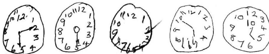
Figure 2 Impaired clock face drawings in dementia.

A few rare syndromes are worthy of mention. Balint’s syndrome consists of a triad of simultanagnosia (inability to