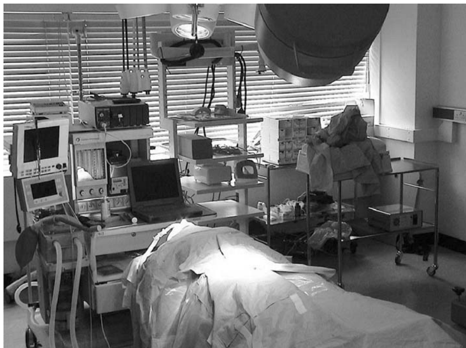
Figure 1 The simulated operating theatre.

In a preliminary study, 25 surgeons of varying grades completed part of a standard varicose vein operation on a synthetic model (Limbs & Things, Bristol, UK) which was placed over the right groin of the anaesthetic simulator. 26 The complete surgical team was present, the mannequin draped as for a real procedure, and standard surgical instruments available to the operating surgeon. Video based, blinded assessment of technical skills discriminated between surgeons according to experience, though their team skills measured by two expert observers on a global rating scale