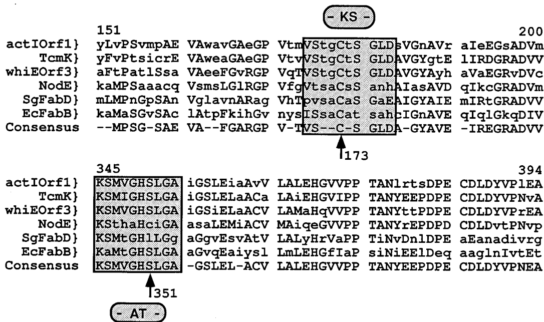
FIG. 3. Comparison of the KS and AT regions of selected type II KS proteins around the proposed active site Cys-173 and Ser-351 residues. actI Orf1 is used for actinorhodin biosynthesis in Streptomyces coelicolor (7), whiE Orf3 is used for spore pigment biosynthesis in S. coelicolor (4), NodE is an R. meliloti nodulation factor (8), SgFabD is a putative type II FAS enzyme of S. glaucescens (31), and EcFabB is the KS I enzyme of E. coli FAS (14).

settes in the tcmK background. S. glaucescens WHM1061 carries a mutation within the chromosomal tcmK gene (32), and as expected, pWHM865 and pWHM877 restored high-level TCM C production upon introduction into S. glaucescens WHM1061 (data not shown). Unexpectedly, all of the other tcmK mutations in both the tcmKLMN 177 and tcmJKLMN cassettes also complemented the tcmK mutation in S. glaucescens WHM1061 to a small degree (Table 2), allowing low levels of TCM C biosynthesis. These results suggest that heterogeneous PKS complexes were formed containing both kinds of mutant TcmK proteins and that these mixed complexes were able to restore a low level of TCM PKS activity by some type of intramolecular interaction between the enzyme subunits. This could mean that TcmK has more than one activity.