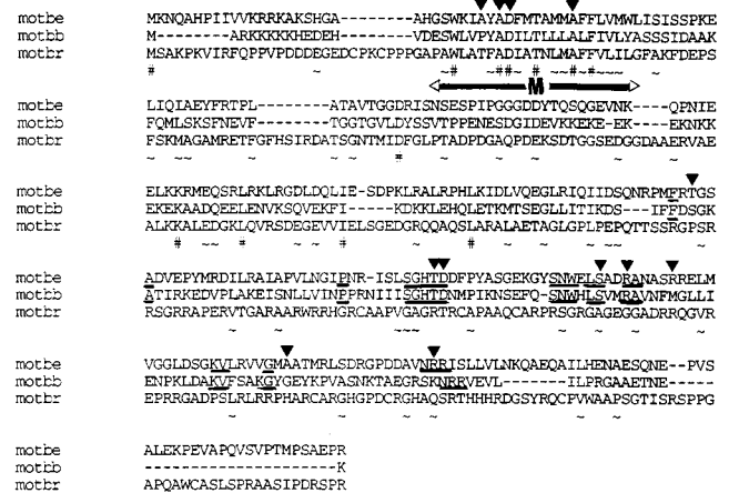
FIG. 3. ALIEN multiple sequence alignment of MotB sequences from E. coli , ( motbe ), B. subtilis ( motbb ), and the MotB ORF shown in Fig. 2 ( motbr ). #, identical residues; ~, conservative substitutions. Conserved residues in E. coli and B. subtilis proposed to be involved in peptidoglycan binding (10) are underlined. The extent of the putative membrane-spanning region is marked underneath the sequence with M & arrows. E. coli MotB residues found by Blair and coworkers (6) to give dominant nonmotile phenotypes when mutated are marked with triangles.

sequence were available for analysis. Given these homologies, we have designated the R. sphaeroides gene as motB rather than para1 . The amino acid sequence is presented underneath the nucleotide sequence in Fig. 2. At the N terminus of MotB there is a region of 20 amino acids which has the characteristic positively charged N terminus and hydrophobic proline-containing central region of a signal sequence, but it is not predicted to be cleaved by signal peptidase when tested by the UWCGC Sigcleave program.