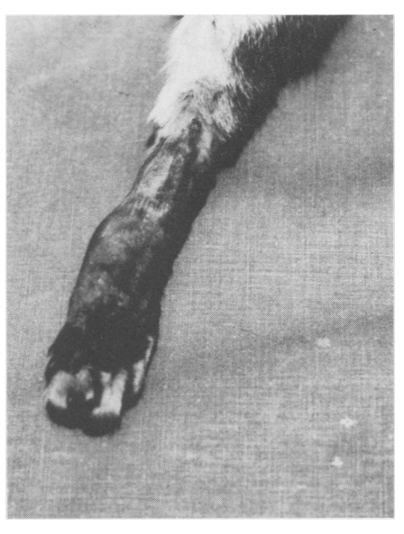
FIGURE 1. Subcutaneous nodule caused by Exophiala jeanselmei.

After three months of ketaconazole therapy the mass had become progressively softer with less distinct borders until it had almost disappeared. The cat was healthy but because of the lowered white blood cell count it was considered advisable to reduce the dose. Within three weeks the mass had enlarged again and in spite of restoring the dose of ketaconazole to the original level the mass continued to spread until it involved the leg from stifle to