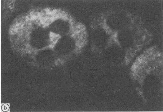
Fig 1 Antineutrophil cytoplasm antibody staining detected by indirect immunofluorescence in a patient with (a) Kawasaki disease and (b) Wegener's granulomatosis.