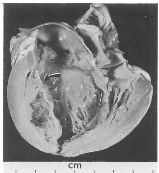
Figure 1 Opened hydatid cyst in left ventricle. Arrow indicates site of rupture behind sectioned papillary muscle.