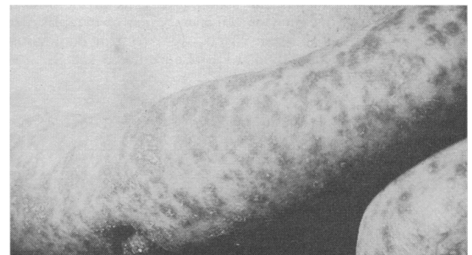
FIG. 2—Close-up showing reticulate and hyperkeratotic rash on the arm.

Investigations. —Chest x-ray films showed progressive patchy consolidation of both mid-zones. Haemoglobin was 10.7 g/100 ml but fell terminally to 7.7 g/100 ml. The platelet count ranged from 64,000 to 40,000/mm 3 . The initial total white cell count was 5,300/mm 3 , with 3,000 lymphocytes/mm 3 , but fell to 1,900/mm 3 , with 600 lymphocytes/mm 3 . A skin biopsy showed patchy dyskeratosis,