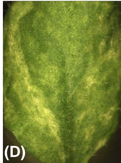
(D) val1-1/val1-1 val3-3/val3-3