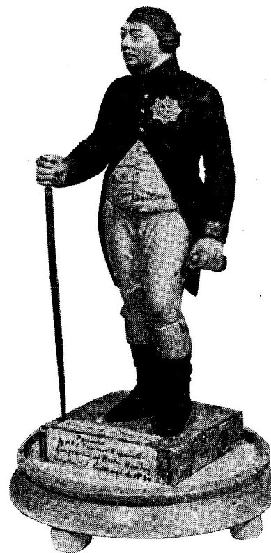
Statuette of King George III.

The public bulletins were made colourless out of respect for the royal family and designed to allay alarm rather than record medical facts. They were intended to reveal no more than was