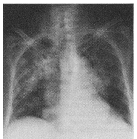
FIG. 2—Diffuse miliary pattern in lungs before therapy.

ADH is normally released from the posterior pituitary in response to increased serum osmolality or decreased intravascular volume. The latter is thought to be the more important. There are several possible reasons for the inappropriate release of ADH in patients with tuberculosis. It is most likely that, in patients with tuberculous meningitis, ADH is released directly from the posterior pituitary, as in many diseases affecting the central nervous system.<sup>17</sup> SIADH in pulmonary tuberculosis and in other infectious pulmo-