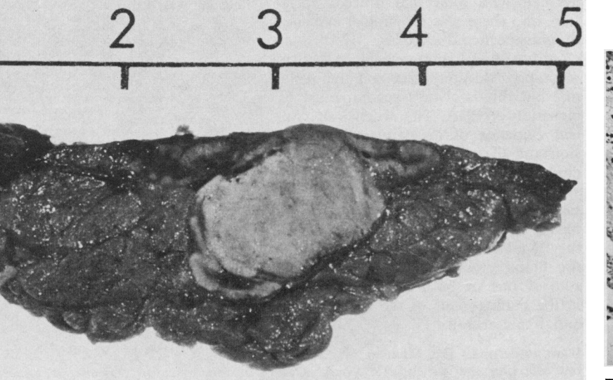
FIG. 2-Right adrenal gland: pheochromocytoma on left; adrenal adenoma in centre.