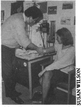
GPs will need to acquire new skills for their purchasing role in the medical marketplace

Our proposed approach rests largely on the experiences of industries outside health care that have faced an urgent need to improve. It was the Japanese, challenged by the massive task of postwar industrial reconstruction, who led the way in applying the principles of management that have since come to be called "continuous quality improvement" or "total quality management" (TQM). Taught largely by American experts sent to Japan to help in the 1950s, Japanese manufacturers developed their skills in making products and services that could better satisfy their customers. The result is international economic history. In many areas of production Japanese firms have acquired worldwide dominance in the past two decades, forcing the developed countries of the West to re-examine their own approaches to management.