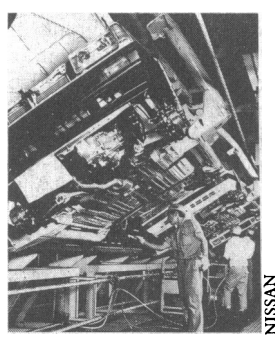
Total quality management has enabled the Japanese to dominate many areas of production

The experience of process failure is frustrating and demoralising for people at work. Those symptoms—frustration and low morale—are seeping into health care widely today. The early practitioners of TQM in health care think they understand a good deal about why that is occurring. Health care is frustrated because it has not learnt how to get better. TQM, with its emphasis on continually improving the overall process