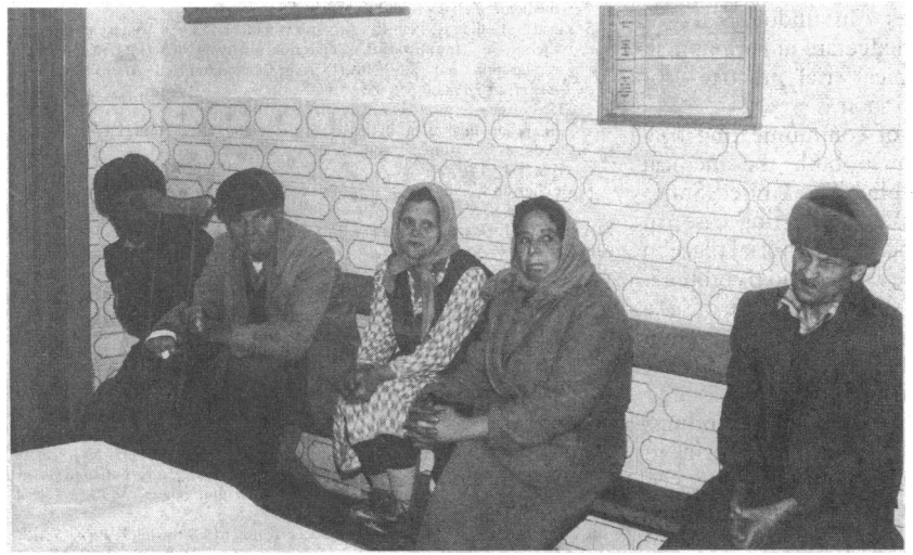
FIG 1—Patients waiting for eye examination

Ophthalmic examination—Eye examinations were carried out according to guidelines set for collecting data on ocular complications of leprosy,<sup>2</sup> and the