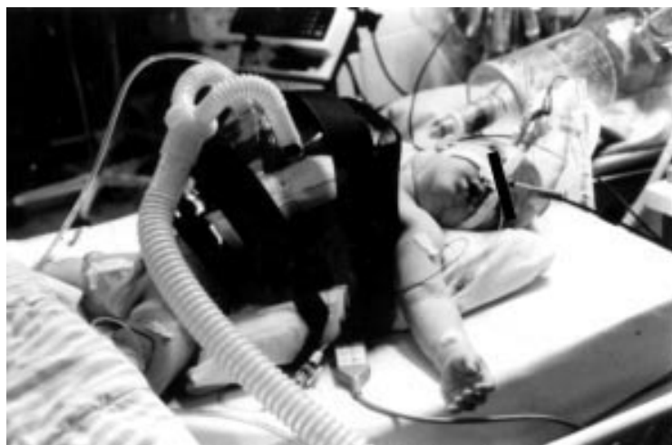
Figure 1 Cuirass negative pressure ventilation in a postoperative patient who was studied four hours after closure of a ventricular septal defect.

or colloid administration during the study period.