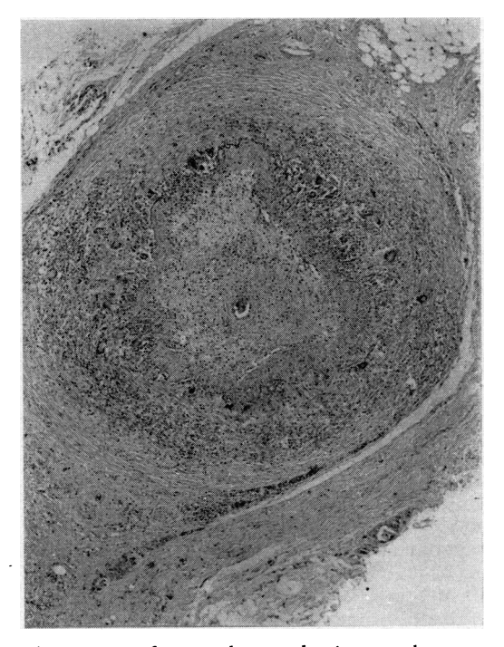
Fig 1 Section of temporal artery showing granulomatous arteritis with giant cells.

The clinical features of giant cell arteritis are largely dependent upon gradual arterial occlusion. Involvement of the temporal, occipital and facial branches of the external carotid, and of the ophthalmic branch of the internal carotid, reigns supreme. But the clinical horizon has changed and expanded far beyond its original confines, and now includes the effects of occlusive arterial disease on the scalp, eye, brain, limbs, muscles, heart and abdominal viscera. Indeed, cases without local temporal artery symptoms have been described. The gradual nature of the