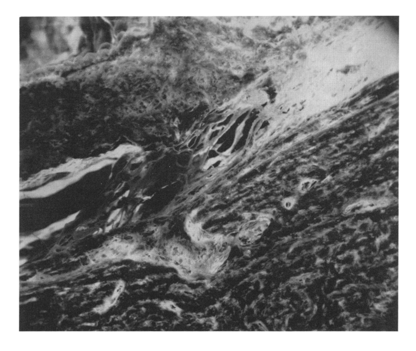
Figure 1—Sagittal section of a 32-monthold beagle with glaucoma. The iridocorneal angle and sclerociliary cleft are open and the trabecular meshwork is normally developed. (SEM, ×131)

ocular pressure, eg, pilocarpine, epinephrine, dipivalyl epinephrine, acetazolamide, ethoxzolamide, methazolamide, and dichlorphenamide.<sup>13-16</sup> Intraocular pressure in these affected dogs decreased to a greater extent in both mm Hg and percentage of drop than normal dogs. Water loading also produces abrupt elevations in intraocular pressure of a greater magnitude and a longer period of time than in normal control Beagles.<sup>17</sup> Serum cortisol in beagles with