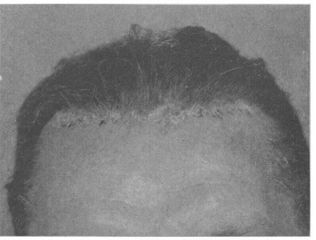
Fig. 3.—Lesions of the forehead.