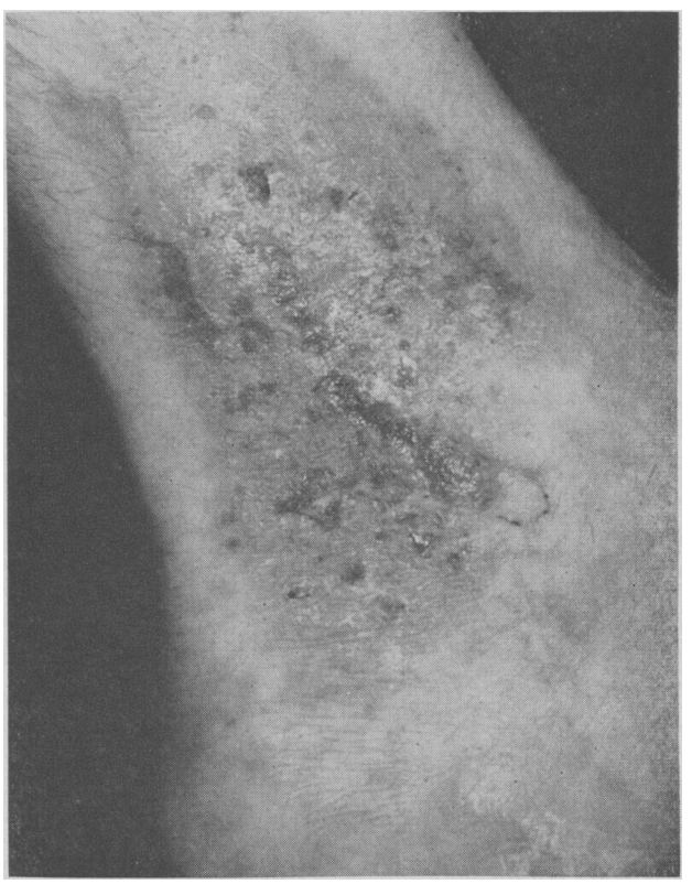
Fig. 5.-Lichenified psoriasis.

Clinical Application of Knowledge of the Koebner Response