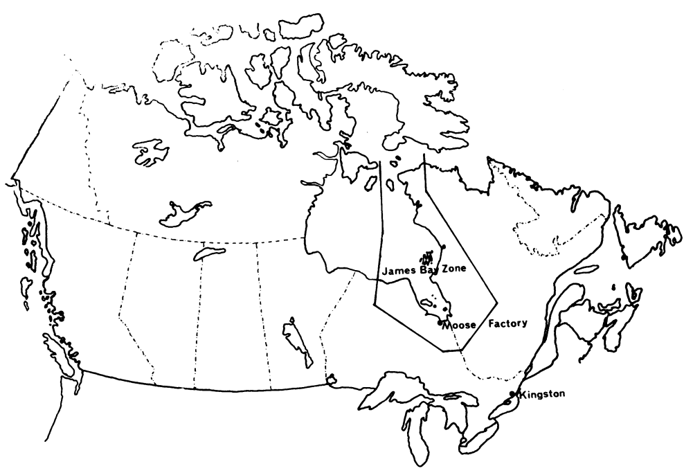
Fig. 1.—Sketch map of Canada to show the location of the James Bay Zone, Moose Factory and Kingston.

The headquarters for the Health Service to the Zone is the Moose Factory Indian Hospital. The Zone superintendent is also the medical superintendent of the hospital. There is a potential staff of six doctors but seldom are all the posts filled. The hospital itself, built in 1950, has 170 beds. Half of these are devoted to tuberculosis for pa-