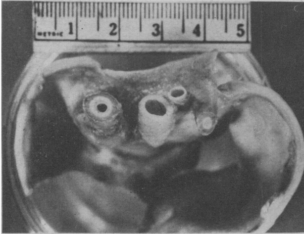
Fig. 1.—Great vessels. This photograph of the aortic arch branches demonstrates: (1) on the left, the greatly thickened and narrowed innominate artery, its coats being distinguishable in the gross; (2) the normal left common carotid artery; (3) the thickened obliterated left subclavian artery. The left vertebral artery has an anomalous origin directly from the aortic arch, can be seen between the left common carotid and the left subclavian vessels and shows no lesion.

The heart itself was normal but the pericardium showed firm, fibrous adhesions nearly obliterating the pericardial sac. The aortic arch was normal but there were striking changes in its branches—the innominate