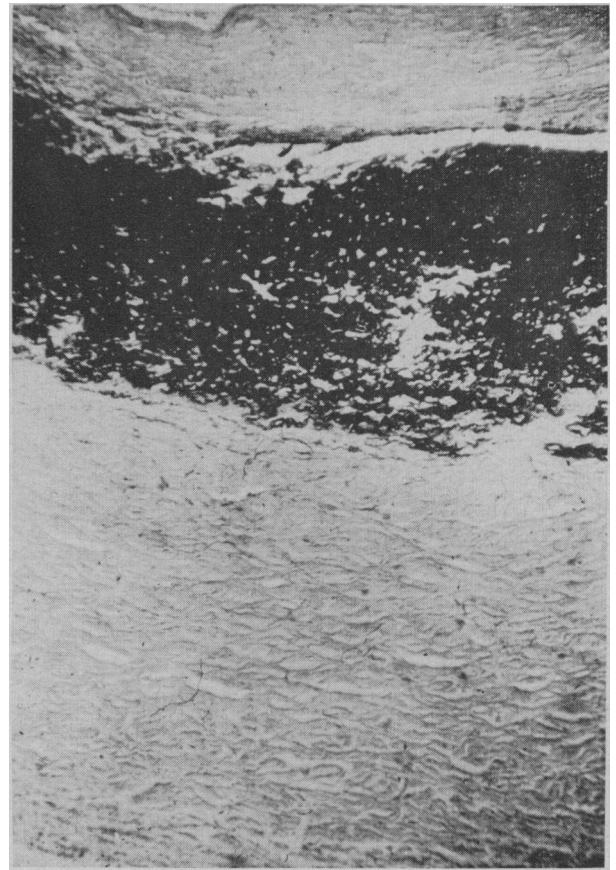
Fig. 3.—Innominate artery wall. (Elastic tissue stain. The lining appears at the extreme top of the section.) The intima and especially the adventitia show great thickening by dense collagenous mature fibrous tissue. That the media has been compressed is indicated by the densely compact elastic tissue. There is no inflammatory reaction.

artery was greatly thickened and stenosed, as were the right common carotid and the two subclavian arteries. In each case the coats of these vessels were clearly defined and the thickening was seen to be of the adventitia and the intima. From the lower half of the thoracic aorta down to its termination, there was a thick, opaque, pearly white fibrous replacement of the aortic intima accompanied by fibrous thickening of the adventitia, and at the diaphragmatic level there was narrowing of the aortic circumference from 4.5 cm. to 2.5 cm. The factor of the organization of mural thrombus cannot be neglected in any attempt to explain intimal thickening but in this case it certainly could not account for the medial and adventitial changes.