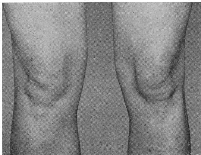
FIG. 2.—Minor scarring of the skin in patient (Case 8), with the highest birth-weight (7½ lb.; 3,400 g.) in this series.