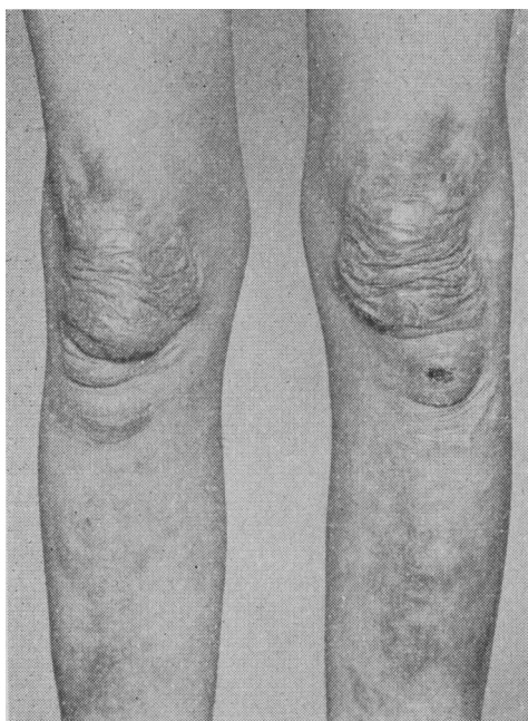
FIG. 1.—Severe scarring of the skin in patient (Case 4) with the lowest birth-weight (3½ lb.; 1,590 g.) in this series.

The following hypothesis may therefore be formulated. In Ehlers-Danlos syndrome the fragility of the foetal tissues is shared by the foetal membranes. Towards the end of pregnancy, when further decrease in the strength of foetal mem-