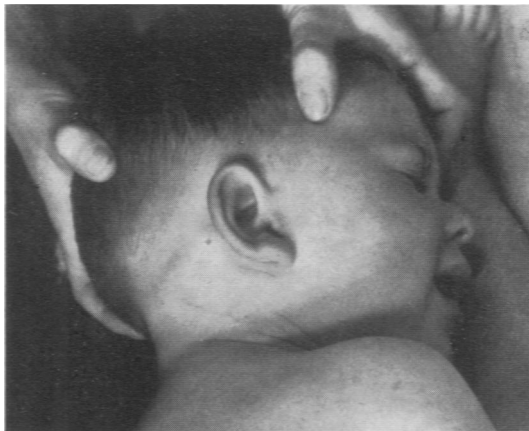
FIG. 2a.—Thrombosed mastoid emissary vein in Case 7.

The skull was normal radiologically, and the white blood cell count was 12,000 per c.mm. The cerebrospinal fluid was not under pressure, contained two cells per c.mm., with protein 28 mg. %, sugar 95 mg. %, and chlorides 720 mg. %.