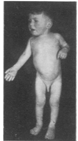
FIG. 2b.—The child five months after the onset of hemiplegia.

The child had several right-sided convulsions after admission, and then gradually recovered. Three months later she was still not using the right hand as much as the left, and tended to drag the right foot a little. She had no further fits, and appeared normal mentally.