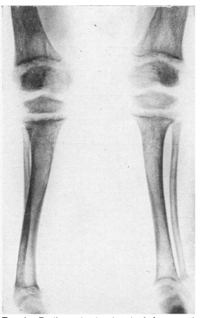
FIG. 1.—Radiograph showing both knees and ankle joints. Note thin cortex and osteoporosis, also enlarged and woolly metaphyses with cupping at the distal end of the tibia.

Analysis for the presence of cystine showed 1 \cdot 1 mg. per 100 ml. The urinary output varied from 14 to 26 oz. per day but accurate