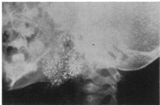
FIG. 2.—Sialogram showing mild sialectasis.

Ollerenshaw and Rose (1951) 1-2 ml. of 'neohydriol fluid' was injected with a syringe and small blunted hypodermic needle into Stenson's duct and lateral and postero-anterior projections were made. In the normal gland the ducts were well outlined and it