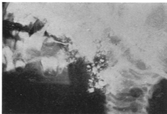
FIG. 4.—Sialogram showing severe sialectasis.

The majority of the cases in this series, all but five, fall into the second group and the \alpha -haemolytic streptococcus was isolated from the parotid saliva in each of these. In the remaining five pneumococci in pure culture were isolated in two and both pneumococci and \alpha -haemolytic streptococci were obtained from the other three. Three of the latter