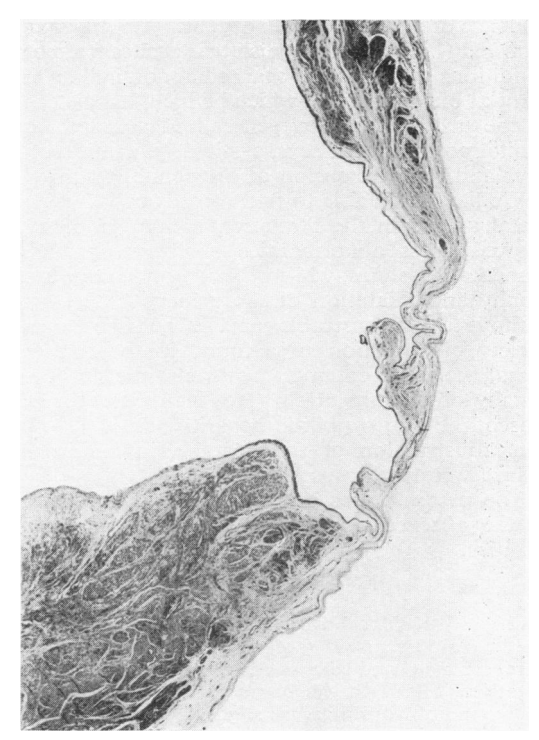
Fig. 2.—Photomicrograph of bladder wall (Case 1) showing localized absence of muscular coat (× 11).

A radiograph showed a large, dense opacity in the lower abdomen displacing the intestine upwards. Under general anaesthesia the prepuce was slit dorsally and a fine bicoudé catheter passed per urethram. During the next 24 hours 2\frac{1}{2} oz. (71 ml.) of urine drained through the catheter. The abdominal distension remained, dullness to percussion appeared in both flanks, and the abdominal wall became oedematous, so 5 ml. 'diodone' was injected through the catheter, and a radiograph showed it concentrated in a small bladder and less concentrated behind the bladder. These findings suggested rupture of the bladder (Dr. C. J. Hodson). Laparotomy (performed by Mr. V. A. J. Swain) at the age of 48 hours showed