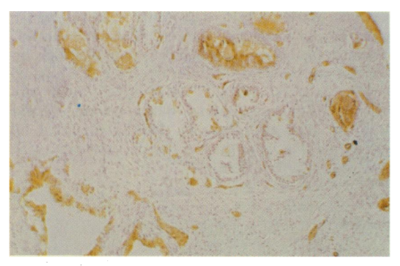
Figure 1 Section from a group A specimen showing benign prostatic hypertrophy. Weak staining of isolated epithelial cells and staining of blood vessels with A15/3D3.92.1 McAb. \times 200 . Counterstained with haemalum.