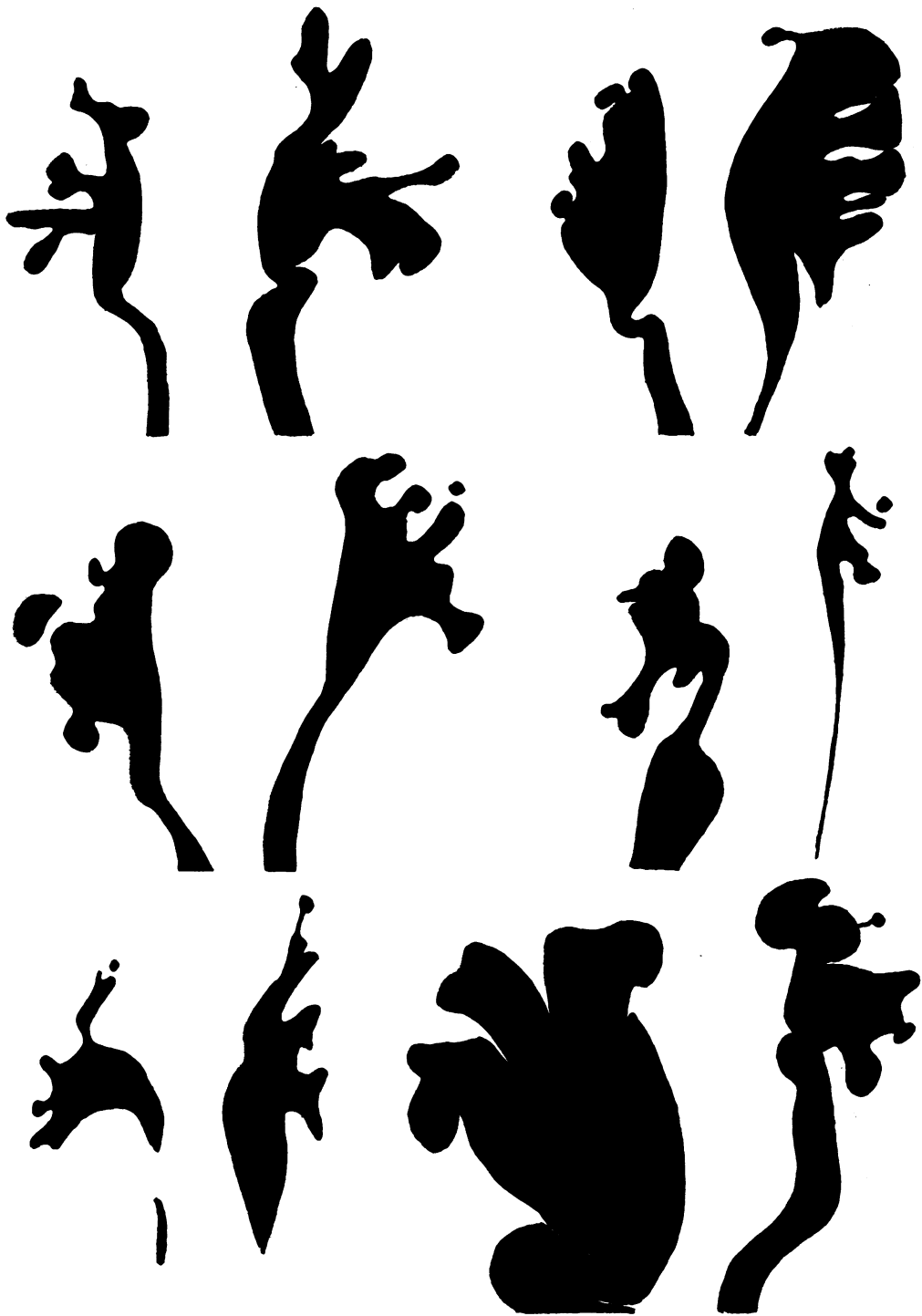
FIG. 4.—Bilateral hypoplastic kidneys. They show the same features as either one of the unilateral types, together with peculiar additional characteristics (see text).