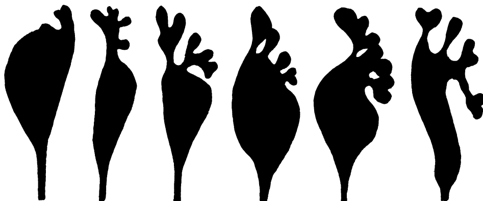
FIG. 1.—Hypoplastic kidneys type I or upper polar type. A few ill-formed minor calices have grown only from the upper pole of the kidney pelvis.

(Fig. 1). It shows the most striking quantitative as well as qualitative stigmata of hypoplasia. Quantitatively, no major caliceal bud had been able to form, and only the upper area of the rudimentary pelvis could grow a few calices of the minor type (from one to four), so that these kidneys represent nothing but a poor upper caliceal budding. For this very reason, their rudimentary pelvises are in line with the ureter, they lie close to the spine in a high internal lumbar location and necessarily take the classical triangular carrot shape which, therefore, is not an accidentally freakish shape. Qualitatively, the few minor calices being underdeveloped show the classical bizarre or club shape, while the corresponding renal lobes are not only scarce, but also underdeveloped, the poor successive buddings having probably stopped after bringing forth a few generations of nephrons.