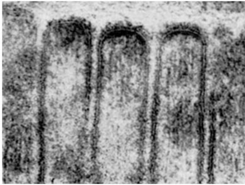
FIGURE 2 Higher magnification electron micrograph of the tips of microvilli of the duodenum. On the outer surface of the apical plasma membrane are seen irregular accumulations of densely stained material. In the cytoplasm within the tip of the microvillus, a zone of increased density is present. Filaments are embedded in this inner dense material. Attachment to the membrane itself cannot be resolved. \times 105,000 .

The appearance of the filaments in rows is probably due to a slight tilting of the core or rootlet.