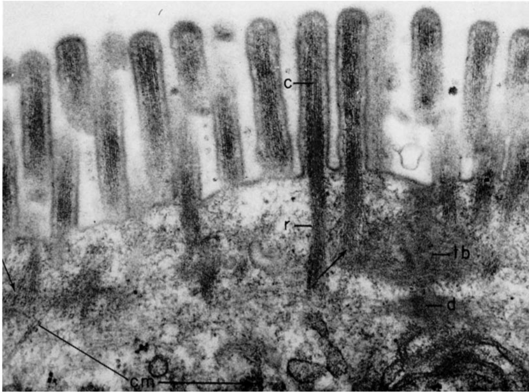
FIGURE 1 Electron micrograph of a longitudinal section through the striated border of an absorptive cell of a duodenal villus. The longitudinally arranged central core ( c ) is composed of straight filaments. These continue into the apical cytoplasm as the footlet ( r ). To the right, a terminal bar ( tb ) and apical desmosome ( d ) have been sectioned obliquely. The terminal web is on the same level as the terminal bar. Similarly, the desmosomal web is on the same level as the desmosome. Arrows indicate angulations of rootlet filaments in the region of the terminal web. Cytoplasmic microtubules ( cm ) can be seen near the terminal web. \times 52,500 .

filament-free zone approximately 200–300 Å in thickness, except at the apex of each microvillus. At the apex the filaments appear to end in the accumulation of dense material adjacent to the inner leaflet of the plasma membrane (Fig. 2). The lower ends of the filaments terminate in the apical cytoplasm as rootlets.