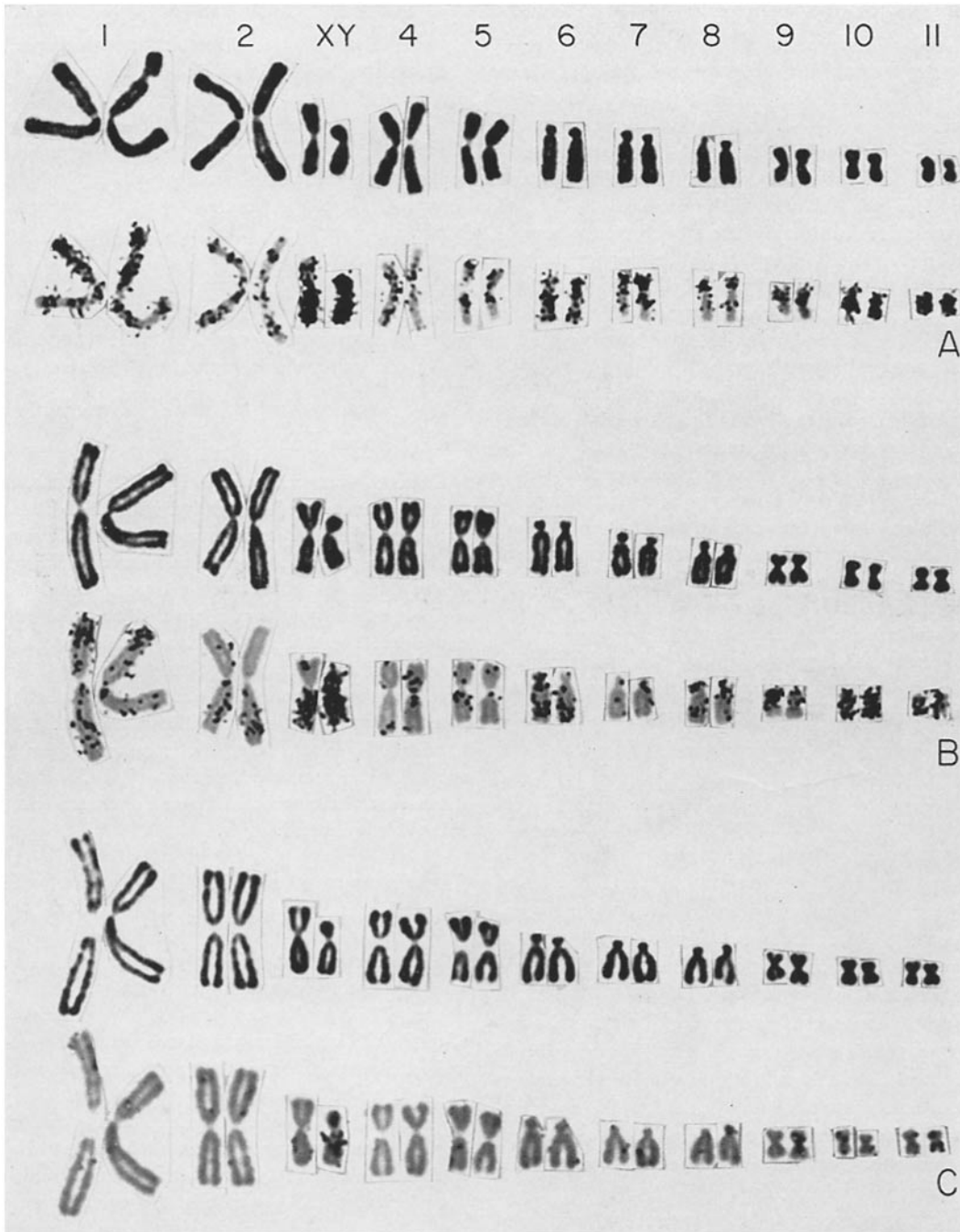
FIGURE 2 Karyotypes (before and after autoradiography) of male Chinese hamster. Continuous tritiated thymidine labeling; Colcemid treatment, 1 hour. Fig. 2 a, H 3 -TdR labeling for 4 hours; Fig. 2 b, H 3 -TdR labeling for 3 hours; and Fig. 2 c, H 3 -TdR labeling for 2.5 hours. \times 3600 .