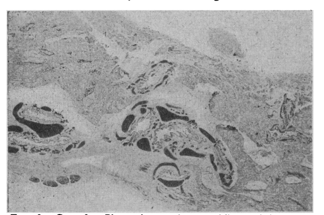
FIG. 2.—Case 2. Photomicrograph near hilum of left lung. Bronchi at hilum seem well developed, the plates of cartilage and glands appearing black. As in a normal lobe, the peripheral plates of cartilage stain paler. A single section gives no idea of the degree of interference with the bronchial-tree development. (\times 3.5.)

FIG. 1.—Case 2. Posterior view of lungs. The smaller, left, lung shows the lower lobe, its edge marked by an arrow, as a nub of tissue against the larger upper lobe: the right lung also is small compared with the tongue size.