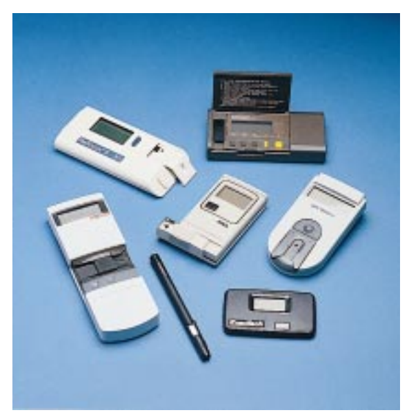
Fig 1 Many gadgets are available to help with self monitoring of glucose, but inappropriate and unhelpful testing is widespread

We now have conclusive evidence that improved control of glycaemia is associated with a significantly lower risk of the complications of diabetes<sup>1</sup>, but there is no convincing evidence that glycaemic control is consistently influenced by self monitoring of blood or urine. When it was first introduced, home monitoring of blood glucose was claimed to lead to a sustained improvement in glycaemic control in insulin dependent diabetes.<sup>2 3</sup> However, the absence of control groups