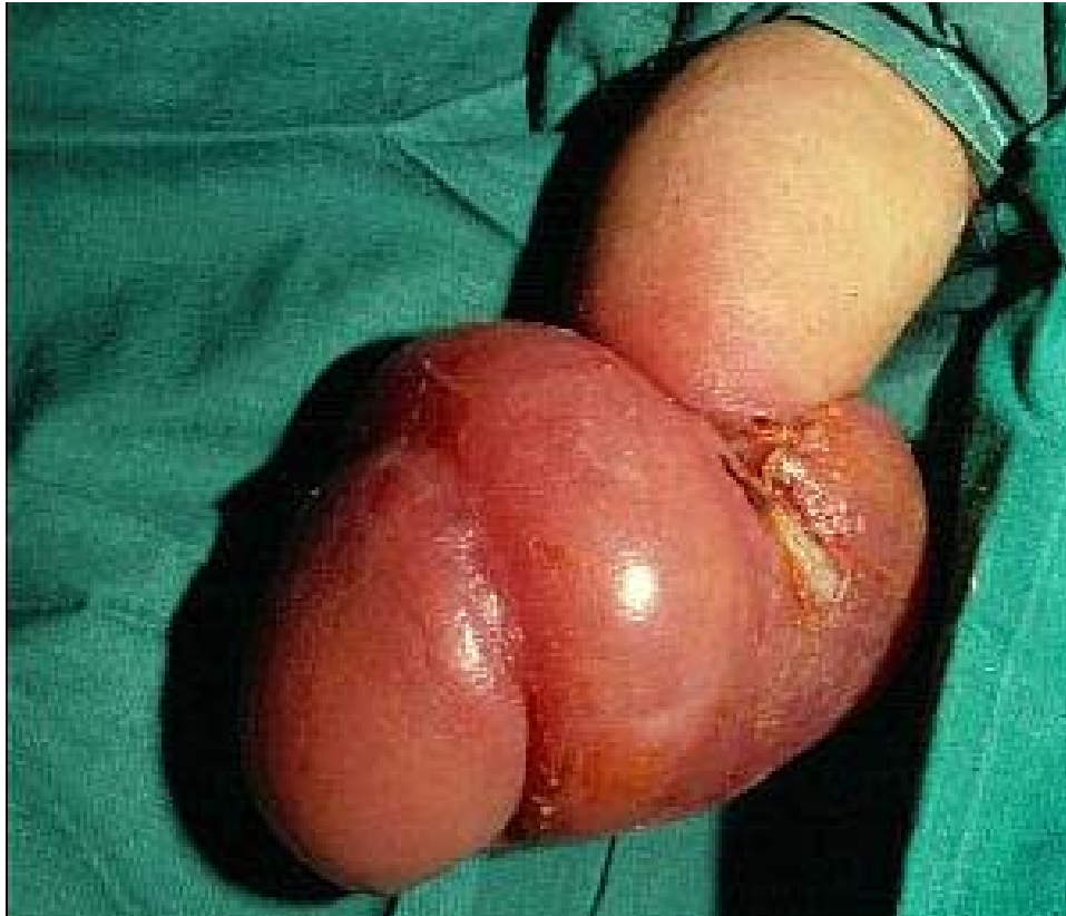
Fig A Paraphimosis