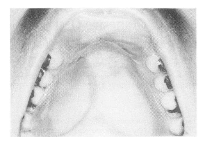
Figure 1. Occlusion of EMLA and placebo creams with three Orahesive Oral Bandages on the hard palate.

greater palatine foramens 0.5 to 1.0 cm above the gingival margin and at right angles to the palatal mucosa. Insertions at the incisive foramen were made at the edge of the incisive papilla according to the description by Haglund and Evers.<sup>8</sup> The sequence of the three palatal insertions was randomized in a balanced way. After baseline needle insertions, a double-blind study regimen was used to apply the EMLA and a placebo cream (similar in appearance, viscosity, and other characteristics to the EMLA cream but without analgesic activity) at the left and right greater palatine foramens. A double-blind parallel group regimen was used at the incisive foramen, where EMLA or placebo was applied to each subject according to a randomized table. The exact amount of 0.4 g EMLA and placebo was determined on a Mettler balance and placed on an Orahesive Oral Bandage (round, 30-mm diameter). The EMLA and placebo were gently applied to the dried palatal test areas and left for 5 min (Figure 1). After removal of the EMLA and placebo, the oral mucosa was cleaned with a gauze swab. Needle insertions were repeated at the three test areas, and the intensity of perceived pain was registered.