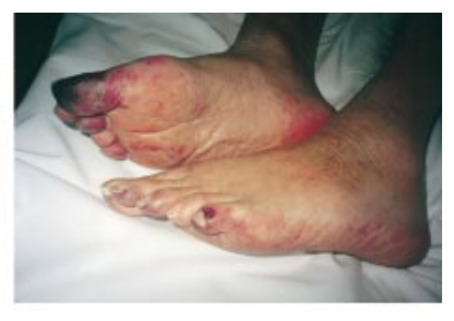
Figure 2 Necrotic lesions of the toes.